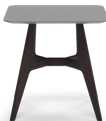
■ E22232X / E22256X

ALL PICTURES SHOWN ARE FOR ILLUSTRATIVE PURPOSE ONLY. ACTUAL PRODUCT MAY VARY DUE TO PRODUCT ENHANCEMENT.