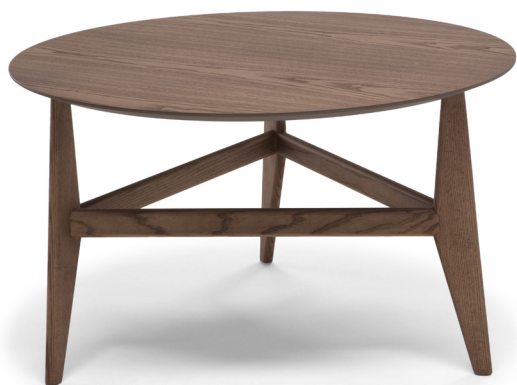
■ E22235X / E22259X