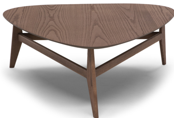
■ E22234X / E22258X