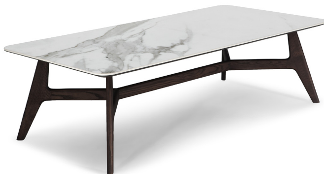
■ E22227X / E22251X