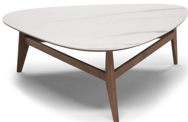
■ E22233X / E22257X